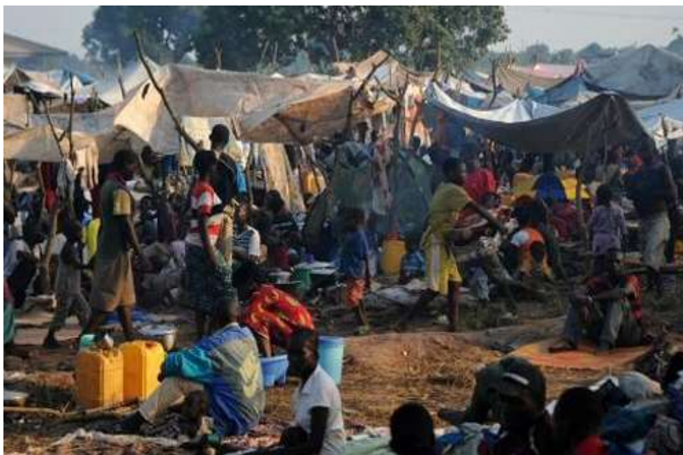
Figure 5 : Central African Refugees in the east of Cameroon

It is the same, the Chinese Ambassador to Cameroon Mr. Wei Wenhua the April 9, 2015, who presented the sum of 20 million CFA francs to the Cameroonian Minister of External Affairs Prof. Pierre Moukoko Mbonjo for food has more than 245,000 Central African refugees located in the east of Cameroon because of the crisis actuates Miss. [19]