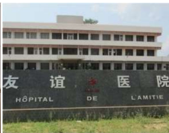
Figure 3: Friendship Hospital at Foh, inaugurate in 1988

At the Ministry of Communication when it has benefited from a transmitting center of the national radio is in the sub prefecture of Ombella M'poko has Bimbo, as well as technical support maintenance and logistics.