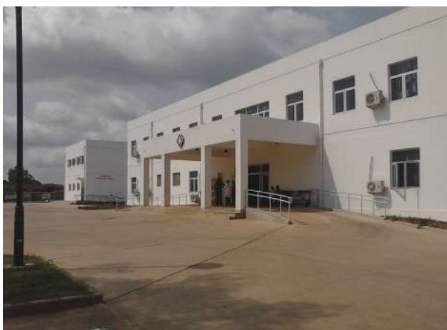
Figure 3: Hospital Elisabeth Domitien at Bimbo, inaugurate October, 04 2011.

The Ministry of Public Health of the population and the fight against HIV / AIDS has received support recycling training of its cadres in the field of the fight against malaria and logistics also to the 2 hospitals Friendship and Elisabeth Domitien .The latter was inaugurated October 4, 2011 by President François Bozize. [15]