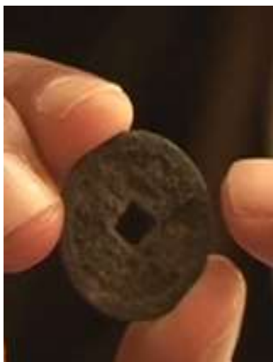
Figure 2: XVe century Chinese coins money.

The history of the bilateral relationship between the People's Republic of China and the Central African Republic had not to understand, that in connection with that of China-Africa. For it the spring of this tradition that we discovered, since the fifteenth century in the Great Zimbabwe Chinese objects such as : Coins and ceramics that is to say, the materials that are made Chinese pottery. Notwithstanding, it is a tangible evidence of a commercial historical relationship between China and the eastern part of Africa under the auspices of the Chinese admiral Zheng He. The latter was the first Chinese to host African soil since the coasts of Somalia, Kenya and Zanzibar.