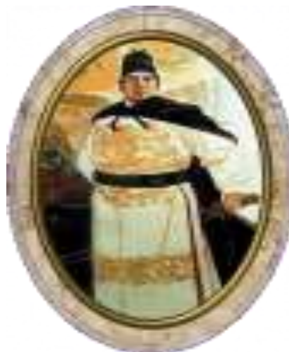
Figure 2: Zheng He.