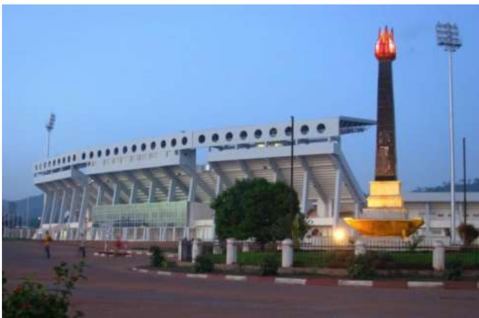
Figure 4 Stadium seats 20,000, inaugurated June 16, 2006

The Ministry of Youth and Sport : China has built and made available to this department a football stadium with a capacity of 20000 seats 16 June 2006 in the presence of Prime Minister Elie Dote, members of government and the Chinese ambassador in CAR Mr. Hesi Ji. [17]